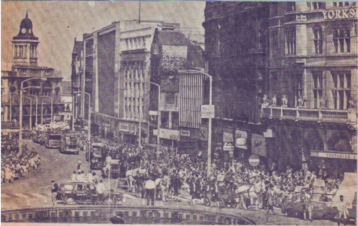
The scene down Fargate showing part of the vast crowd of onlookers as the parade moved slowly towards the Town Hall.

A cavalcade of fire engines commemorating a centenary in the city, from the earliest horse-drawn tenders to today's monsters, was another highlight of the parade.